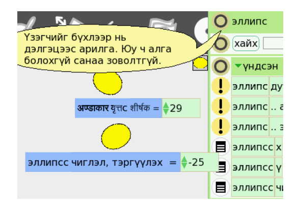
Figure 4. Screen shot of Pango rendered text.

is loaded, it is partially changed to conform to the current locale, so that for example the tiles and controls in scriptors and viewers are translated. But only very rudimentary supports exist for translating user-added text.