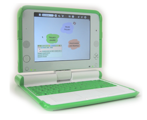
Figure 1. Etoys Activity's start up screen.

At that time, in summer 2004, VPRI had a well-